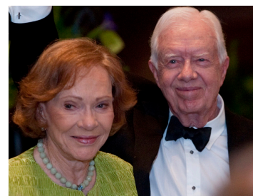
Former First Lady Rosalynn Carter and President Jimmy Carter take a bow