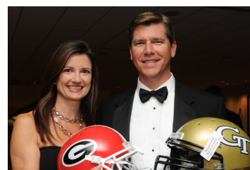
Fans of all institutions come together and enjoy items for bid at the Silent Auction